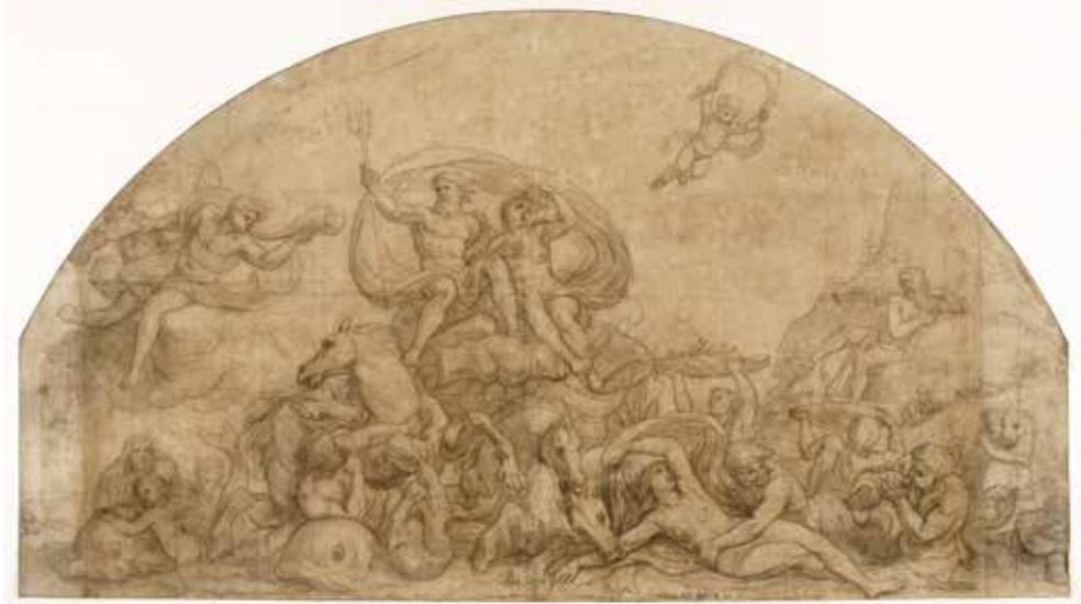
FIG. 6. Charles Le Brun, Neptune and Amphitrite or The Awakening of the Sea , ca. 1663, pen and brown ink, black and red chalk, grey wash, on beige paper, 49,5 x 88,9 cm, Paris, Musée du Louvre, inv. 27686-recto. Photo: Thierry Le Mage © RMN-Grand Palais / Art Resource, NY.

by rooting the concept of radical accessibility to the architectural interior, instead of the intangible and opaque universality of the pre-Revolutionary Salons. Likewise, the exhibit drew attention to the architecture of the Louvre as a product of collective cultural heritage and one accessible through copying, viewing, and understanding its interior. In turn, the display channeled all other artworks on view at the Louvre, especially the works looted from locations throughout continental Europe, into the same shared national inheritance. For example, the catalogue for the 1798 exhibition of works confiscated from Lombardy linked paintings by Ludovico Carracci and Giulio Romano to drawings by the respective artists displayed in the Galerie d'Apollon 43 .