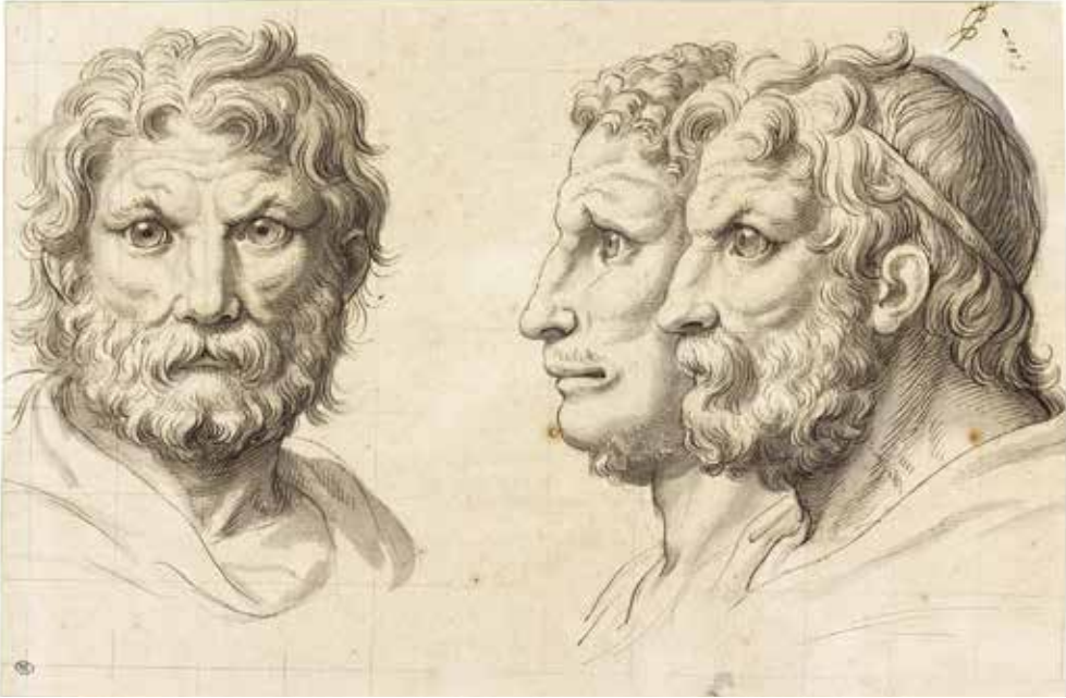
FIG. 4. Charles Le Brun, Relationship of the Human Figure with that of the Lion , black chalk, pen and black ink, brush and gray wash, white gouache on paper, 21,7 x 32,7 cm, Paris, Musée du Louvre, inv. 28156 recto.

artistes, et destiné à faciliter leurs études au Musée Central des Arts, principalement dans la galerie des Dessins. A review of account books from this period confirms that, between 1797 and 1800, the drawing manual sold better than any other catalogue produced by the Museum 31 . Scholars such as Thomas Kirchner and Melissa Percival have situated this book in relation to the primacy of physiognomy in aesthetic discourses and the legacy of Charles Le Brun in this moment 32 . If we consider Le Brun's works individually, his drawings of physiognomy and expression undoubtedly drew artistic and political attention when physical identity was at a moment of crisis 33 . Considering them as a unit offers further insight into how central Le Brun's drawings were in articulating the singularity of the drawing exhibition.