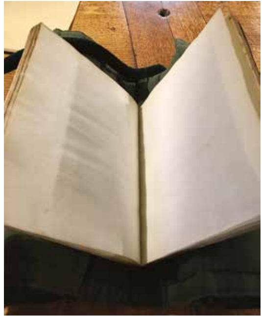
FIG. 5. Recueil de principes élémentaires de peinture sur l'expression des passions... , 1797, in-4, Paris, Bibliothèque nationale de France, Département Arsenal, 4-S-4610.

er art exhibitions. In fact, the Recueil notably differed from earlier French drawing books. Previously, drawing manuals were published by graveurs-inventeurs – such as Gilles Demarteau, Louis-Marin Bonnet and Jean-Charles François – and stressed the technical over the theoretical by centering the manuals on images instead of text. The aim was to locate drawing pedagogy in making copies after prints and through this, disseminate the prints themselves 35 . The 1797 Recueil , however, not only stressed theoretical discourses, but was also intended to be brought into the gallery. Naturally, it had no prints after the discussed works and instead included blank pages (FIG. 5) so that one could sketch in situ . The ability to make drawings at the Galerie d'Apollon