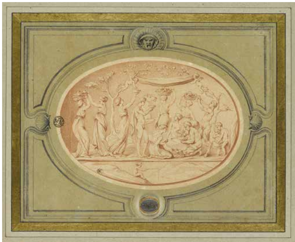
FIG. 1. Edmé Bouchardon, Bacchanal known as Seal of Michelangelo , red chalk, 12,3 x 17,3 cm, Paris, Musée du Louvre, inv. 23849-recto.

mers, widespread public access to the graphic medium commenced in earnest in late seventeenth-and early eighteenth-century Italy. Drawings were sometimes included in exhibitions overseen by Giuseppe Ghezzi in the cloisters of San Salvatore in Lauro in Rome, most notably in 1704, when the Spanish ambassador to Rome loaned drawings to the display 7 . Contemporaneously, the Accademia del Disegno in Florence began staging public exhibitions at the Florentine Church of SS. Annunziata; in 1706, the installation featured drawings by Raphael and Andrea Sacchi 8 . The number of sheets exponentially increased in subsequent iterations and from 1706 to 1737, the Florentine collector, patron, and connoisseur Niccolò Gaburri loaned about 280 sheets to the Florentine exhibition 9 . Amongst the hundreds of Italian and Northern drawings on view in 1737 were sheets by two notable French painters – Antoine Watteau and François Boucher – thus indicating their international reputations for collectors and connoisseurs 10 .