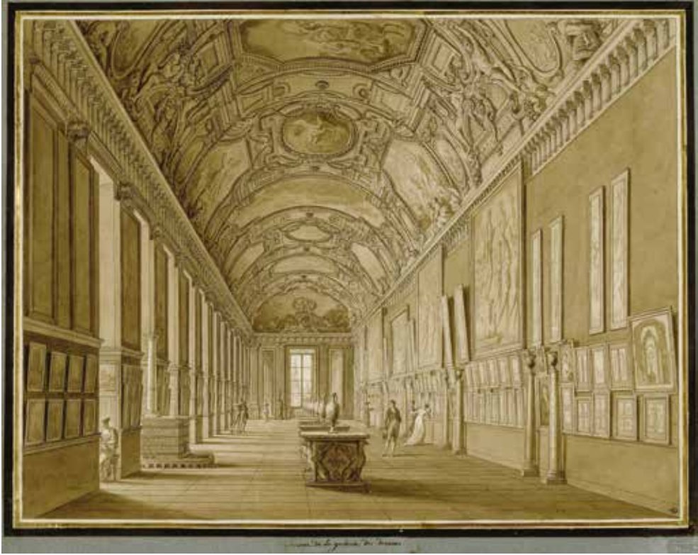
FIG. 3. Constant Bourgeois du Castelet, View of the Gallery of Apollo in the Louvre with a Drawing Exhibition , pen and ink, wash, 33,6 x 44 cm, Paris, Musée du Louvre, inv. RF 29455-recto.

modern drawing displays as objects of “constructive intent”, to repeat Osborne’s assertion 15 . This skewed historic attention is echoed in graphic works such as Gabriel de Saint-Aubin’s panoramic drawings of the Paris Salons. In his unfinished drawing of the Salon of 1765 (FIG. 2), Saint-Aubin expends his meticulous draftsmanship mainly on the paintings, while eight drawings are only fleetingly outlined in the lower left corner 16 . While Saint-Aubin’s sheets have been considered important visual documents of the Salon, his sheet fails to account for some twenty drawings exhibited at the Salon that year.